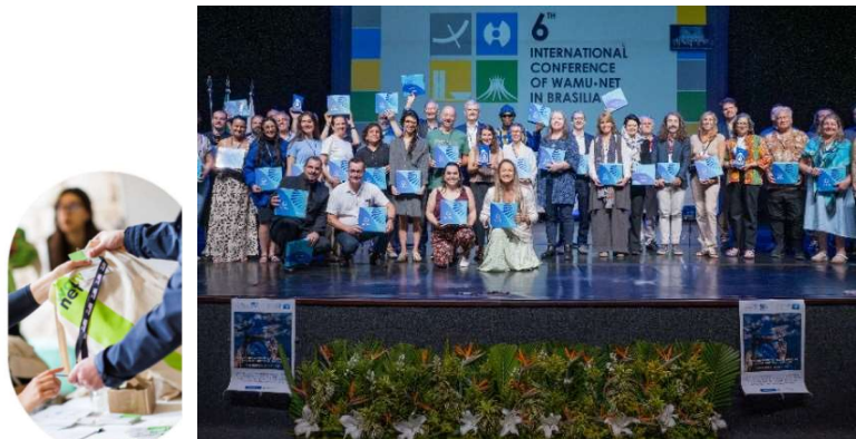
The infographic layout of the conclusions of the 5th International Conference of WAMU+NET (Porto, 2024) and the group of WAMU+NET participants at the 6th Conference in Brasilia (2026).