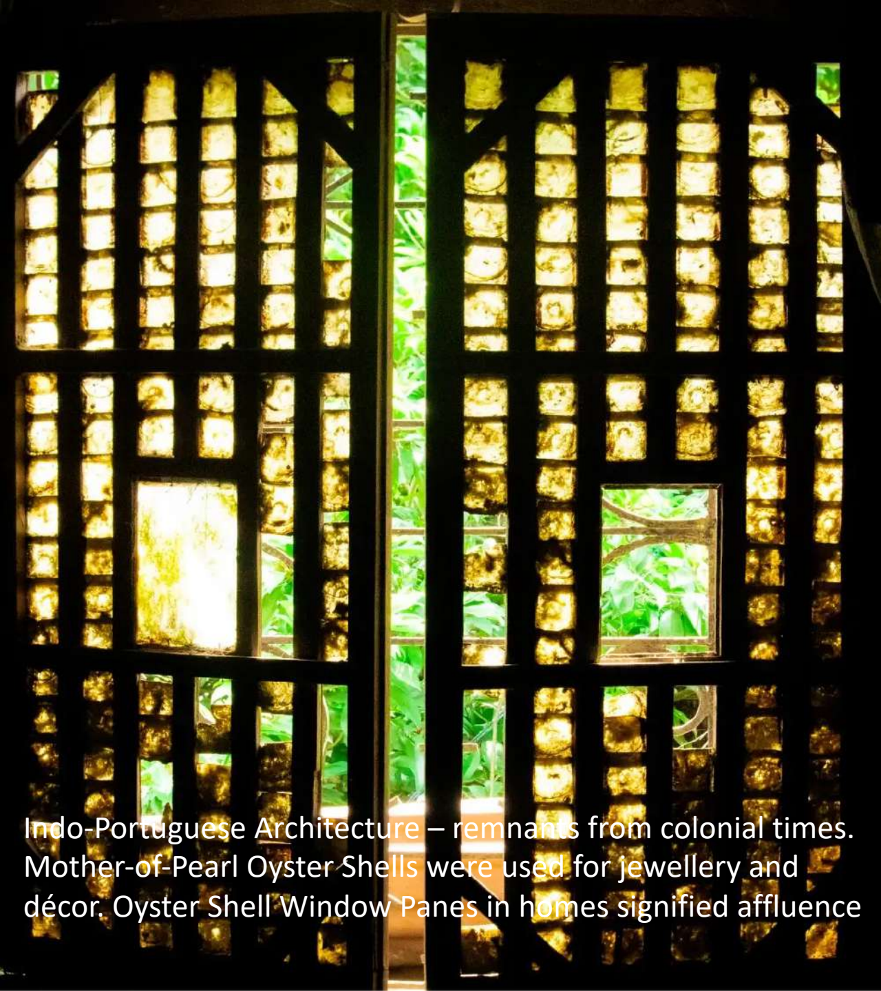
Indo-Portuguese Architecture – remnants from colonial times. Mother-of-Pearl Oyster Shells were used for jewellery and décor. Oyster Shell Window Panes in homes signified affluence